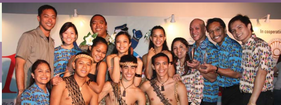
GVB staff and Inetnon Gef Pa'go dancers display awards from the 2010 PTAA in the Philippines.

Click here to learn about more free downloadable tools.